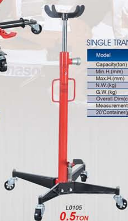
SINGLE TRANSMISSION JACK