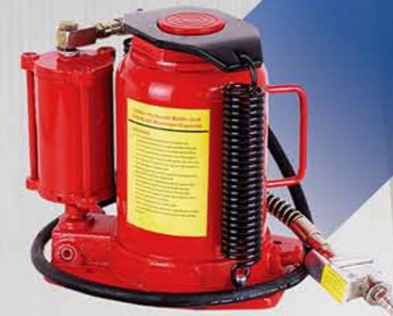
B0709 B0710 B0711 30TON