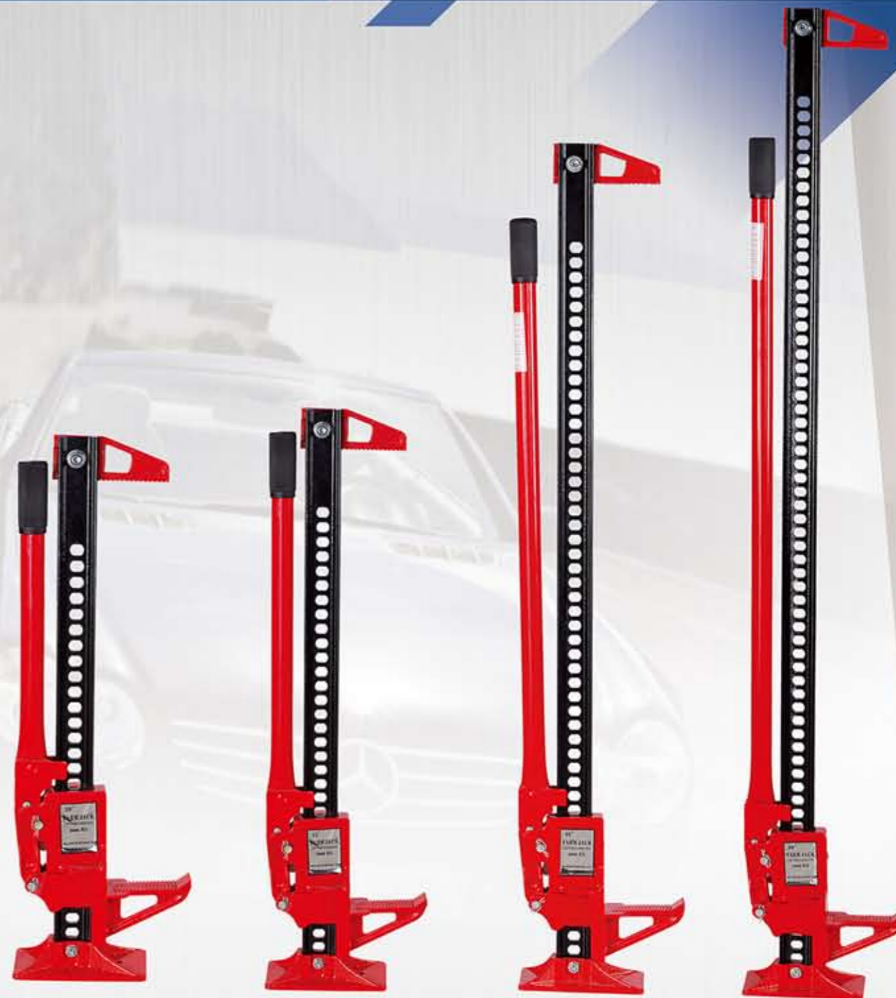
D0101 20" D0102 33" D0103 48" D0104 60"