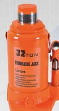
B0112 High 32TON