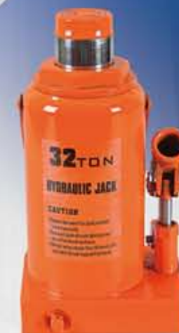
B0113 Thick base 32TON